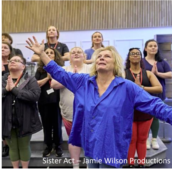
Sister Act