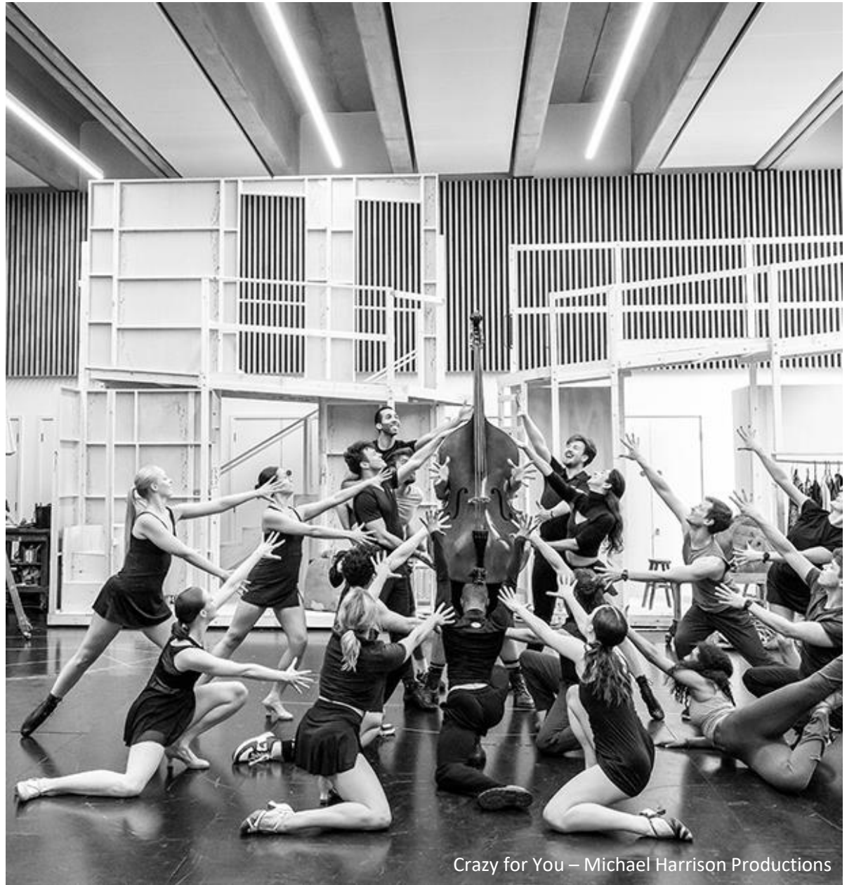
Crazy for You – Michael Harrison Productions