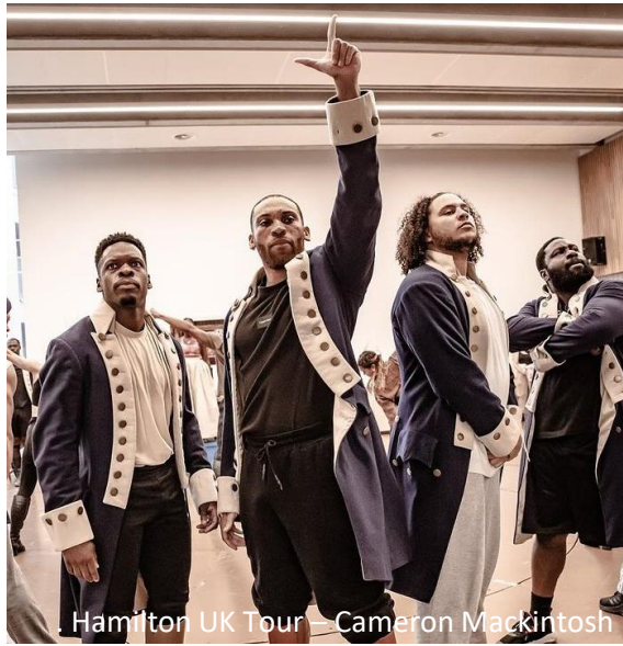
Hamilton UK Tour – Cameron Mackintosh