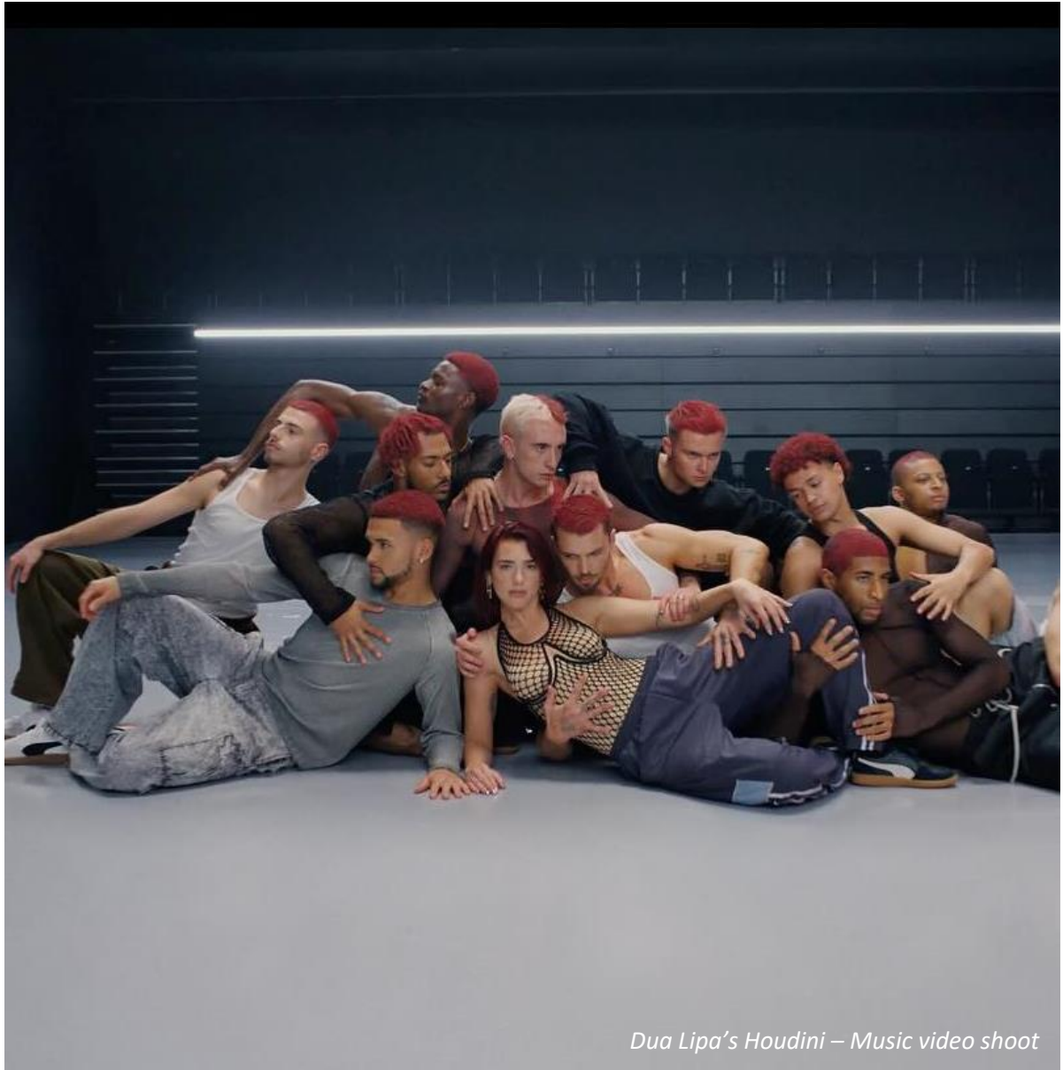
Dua Lipa's Houdini – Music video shoot