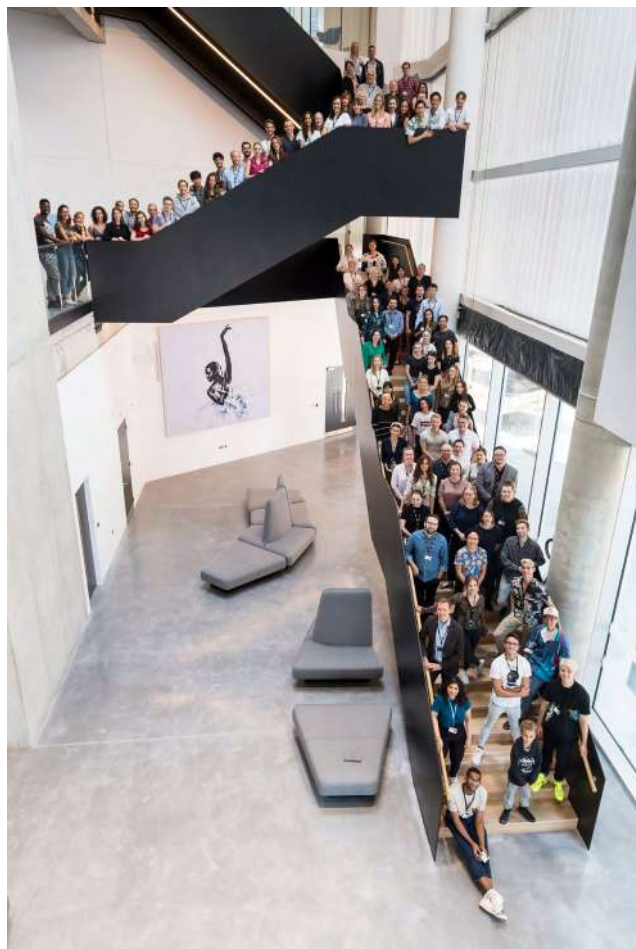
Dancers and Staff of English National Ballet at London City Island in August 2019