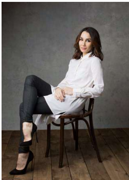
Tamara Rojo