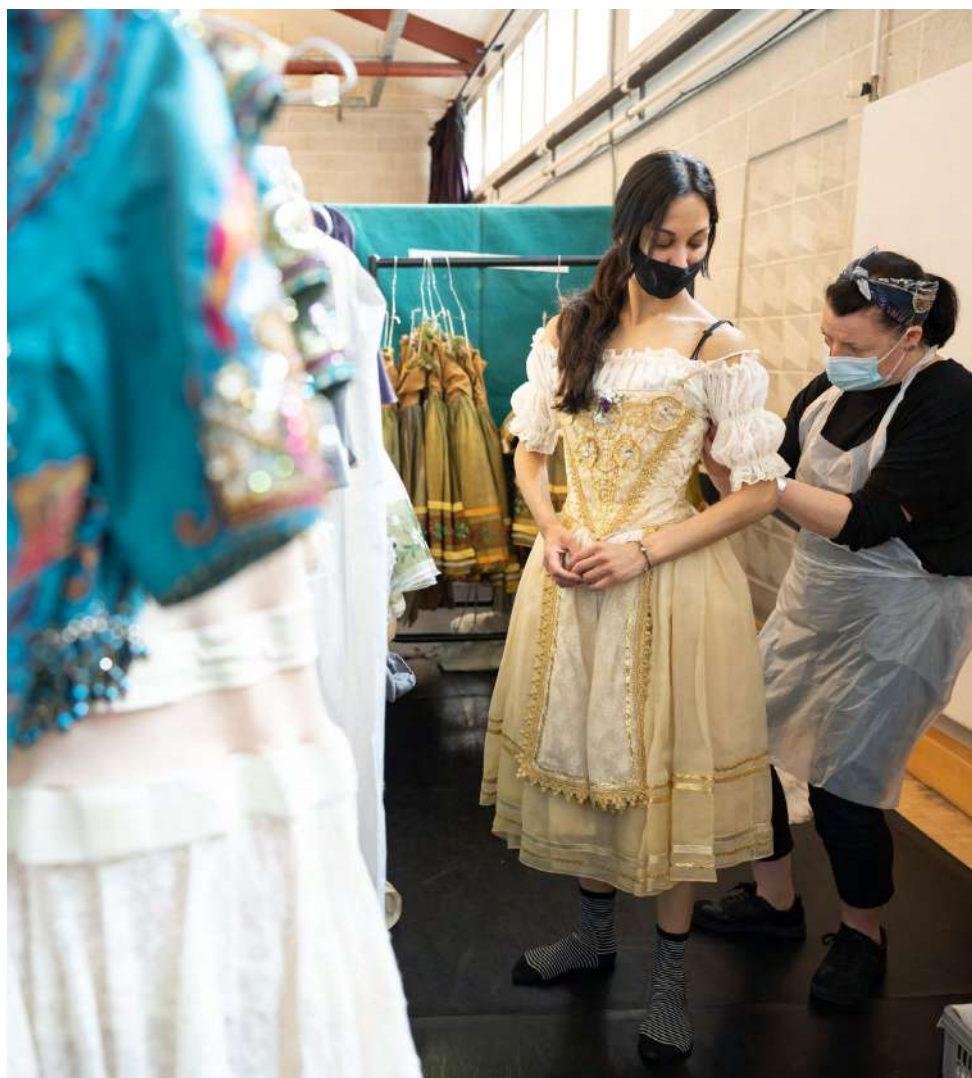
Coppélia costume fitting