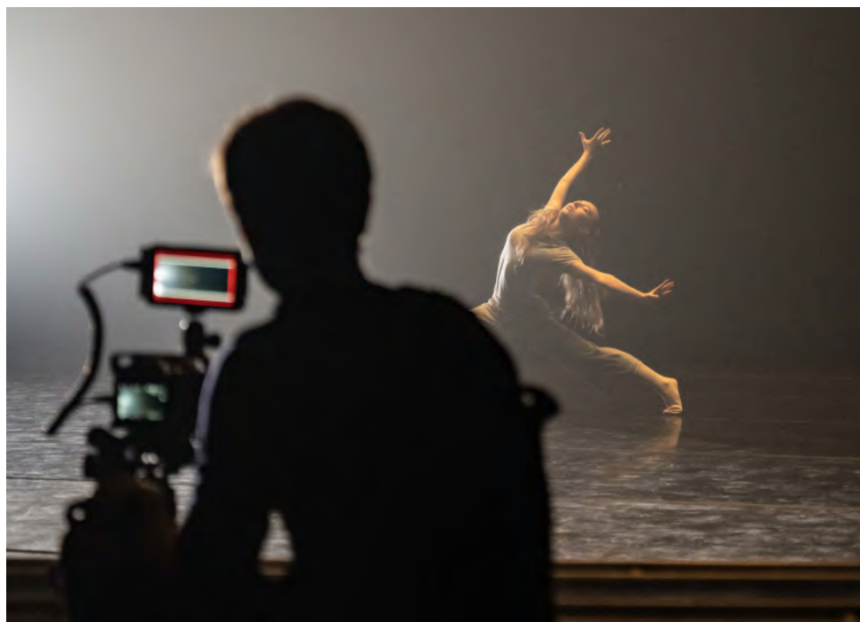
Behind the scenes filming Dance Journeys Digital