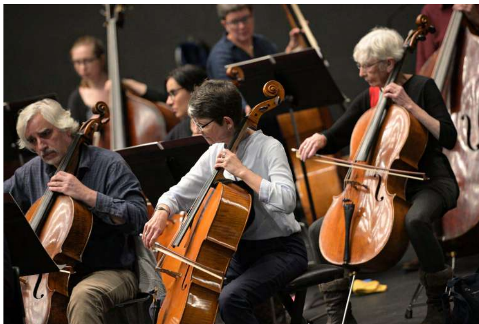
Members of English National Ballet Philharmonic rehearse in 2019