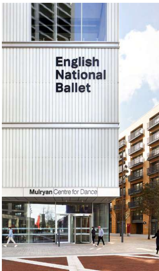
English National Ballet, the Mulryan Centre for Dance at London City Island

You can view a full list of our supporters on our website, and learn more about supporting our work .