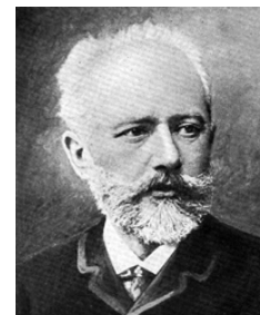
Pyotr Ilyich Tchaikovsky Composer

Created Resolution (2008), nominated for Best Classical Choreography at the Critics' Circle National Dance Awards; Men Y Men (2009); Nutcracker (2010); Jeux (2012)