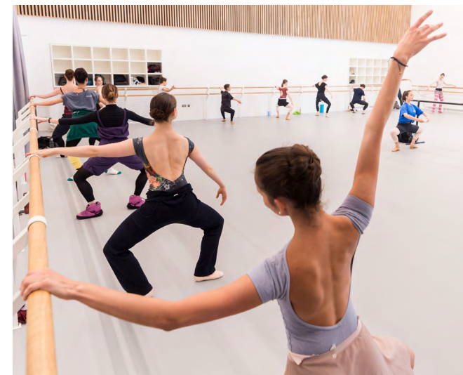
English National Ballet dancers take class in a rehearsal studio at London City Island in 2019