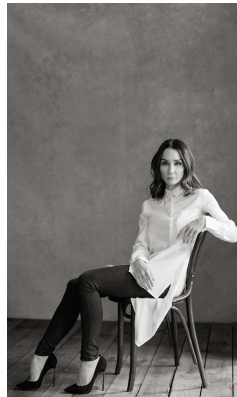
Tamara Rojo © Karolina Kuras