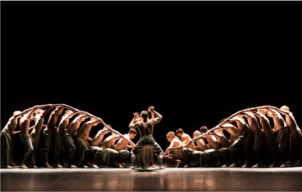
English National Ballet in Akram Khan's Dust at the Company's 70th Anniversary Gala in January 2020

Texts costs the donation and one standard rate message.