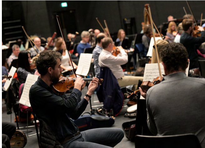
Members of English National Ballet Philharmonic rehearse at London City Island in 2019