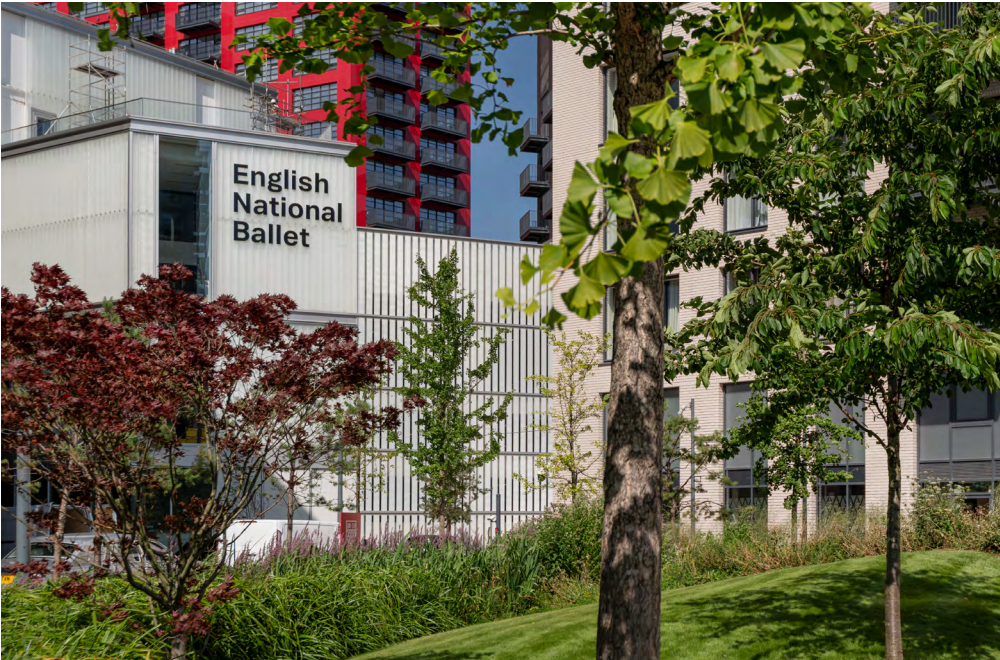
English National Ballet's new home on London City Island

Please consider making a donation today, if you can.